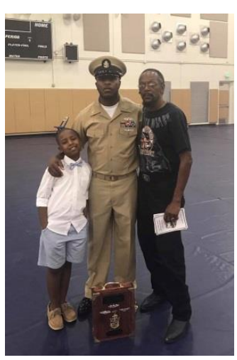
PRAISE YE THE LORD

IT IS NOT HAPPY PEOPLE WHO ARE THANKFUL. IT IS THANKFUL PEOPLE WHO ARE HAPPY.